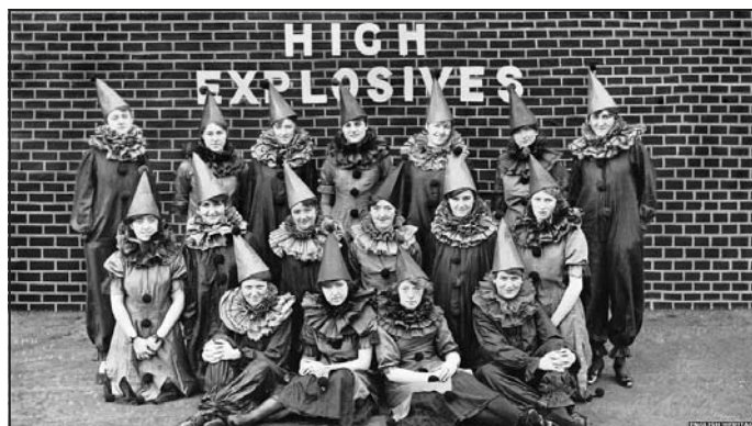
High Explosives performance troupe, Bootle (1917)

Here is just one example from the exhibition - Women munition workers dressed up in comic Pierrot costumes for a performance similar to those popular in seaside resorts and music halls. This picture demonstrates how people let off steam during the First World War.