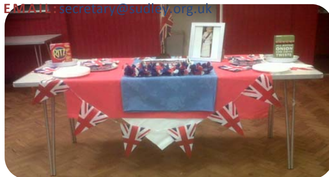
The Thursday morning Craft Group's decorated table to celebrate the Queen's Diamond Jubilee