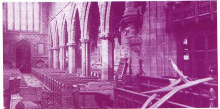
Interior of Mossley Hill Church after bomb damage

If you remember the night or have any Aigburth war time photos we would like to hear from you.