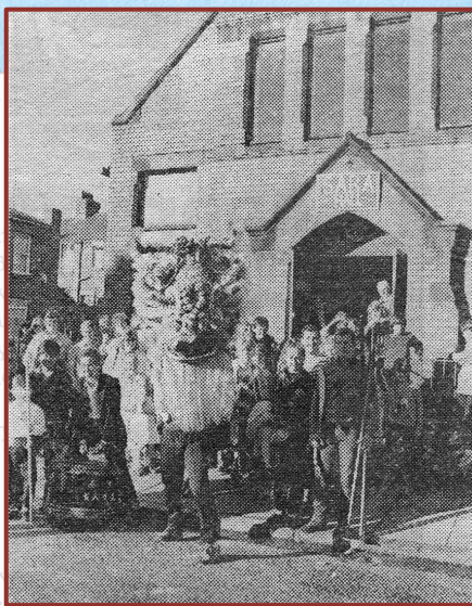
Official re-opening of SARA Hall in 1985

The lease for SARA Hall was acquired in the early 1980's when the former church building was changed from a carpet warehouse to a community centre. The early committee undertook a large project of works to make the building fit for purpose as a community centre. The official re-opening included a traditional lion dance performed by the Hung Kune style Kung Fu Club from Seel Street.