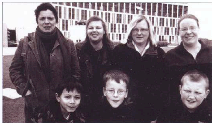
Members of The South Liverpool Friendship Group

Our next round closes on 30th September 2009 and requests for applications are currently being accepted.