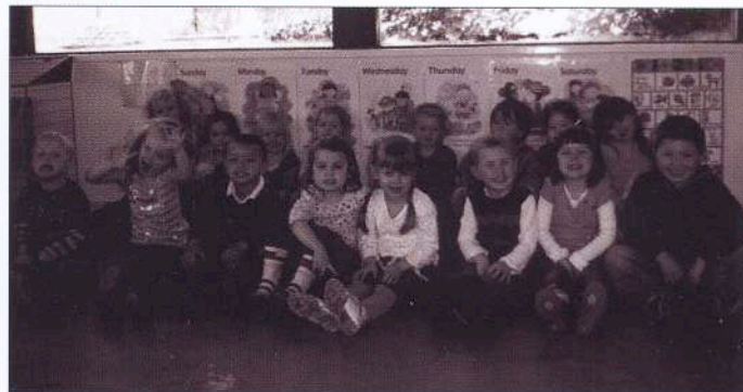
Children from Pavilion Pre-School (Aigburth)

For further details, please call 0151 726 0805, email youthrecognitionawards@sudley.org.uk or write to SARA Hall, Rundle Road, Liverpool L17 0AQ.