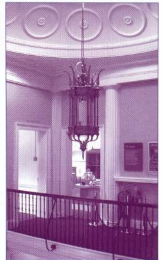
Sudley house Upper landing Detail

The evening ended with guests being left to tour the remaining parts of the house at their leisure.