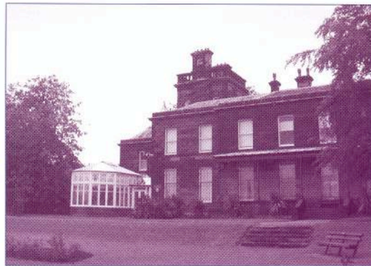
Sudley House Rose Garden