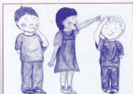
Pavilion Pre-School (Aigburth)

We have a small number of spaces available at present for pre-school children,