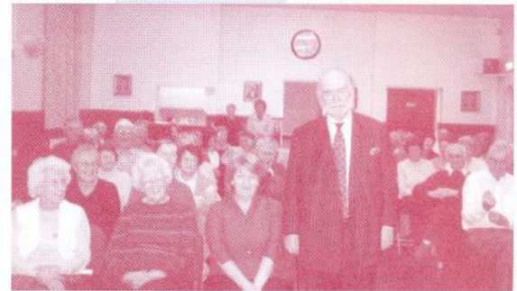
Above: Local residents who attended a recent talk at the SARA Hall

The Harmony Singers also donated their fee to the charity. In total, to date we have collected £207.70