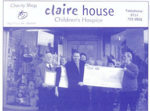
SARA Committee members presenting the cheque to Claire House Allerton Road

Claire House were greatly appreciative of our donation and we are sure that it will go to great use.